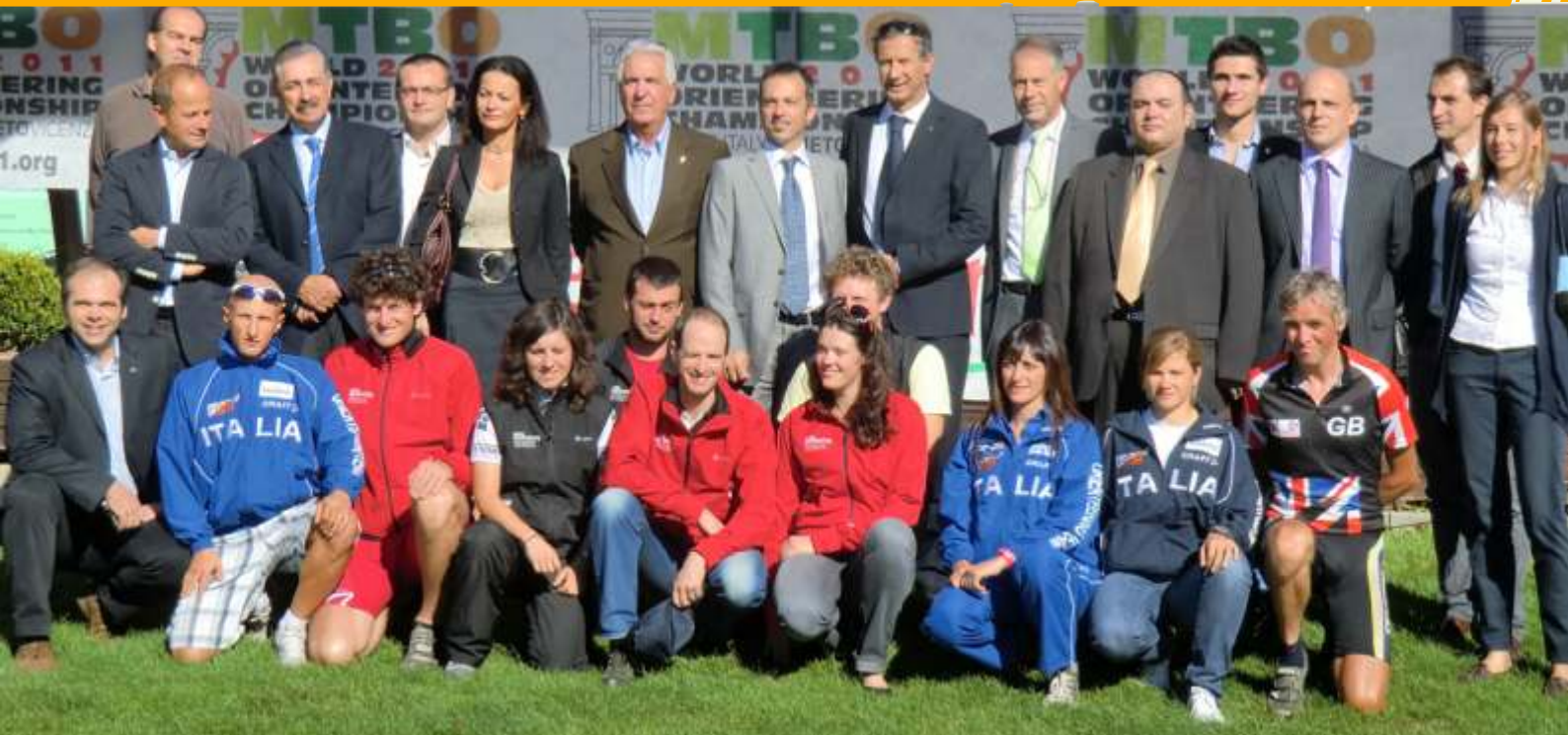
BRENDOLA, MTBO 2011 Official Presentation